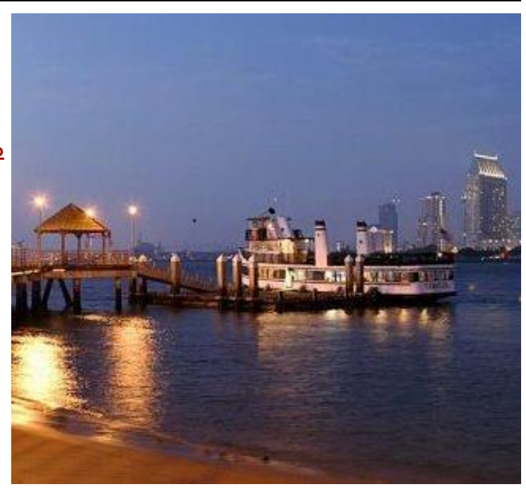
Coronado Ferry. Used with permission.

Conference Dates: September 10—12, 2013 Conference Registration Fee: $595